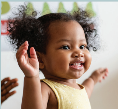
Pictured child is not represented in the above story.

She loves music, playing with instruments, and engaging with her peers.