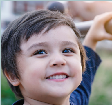
Pictured child is not represented in the above story.